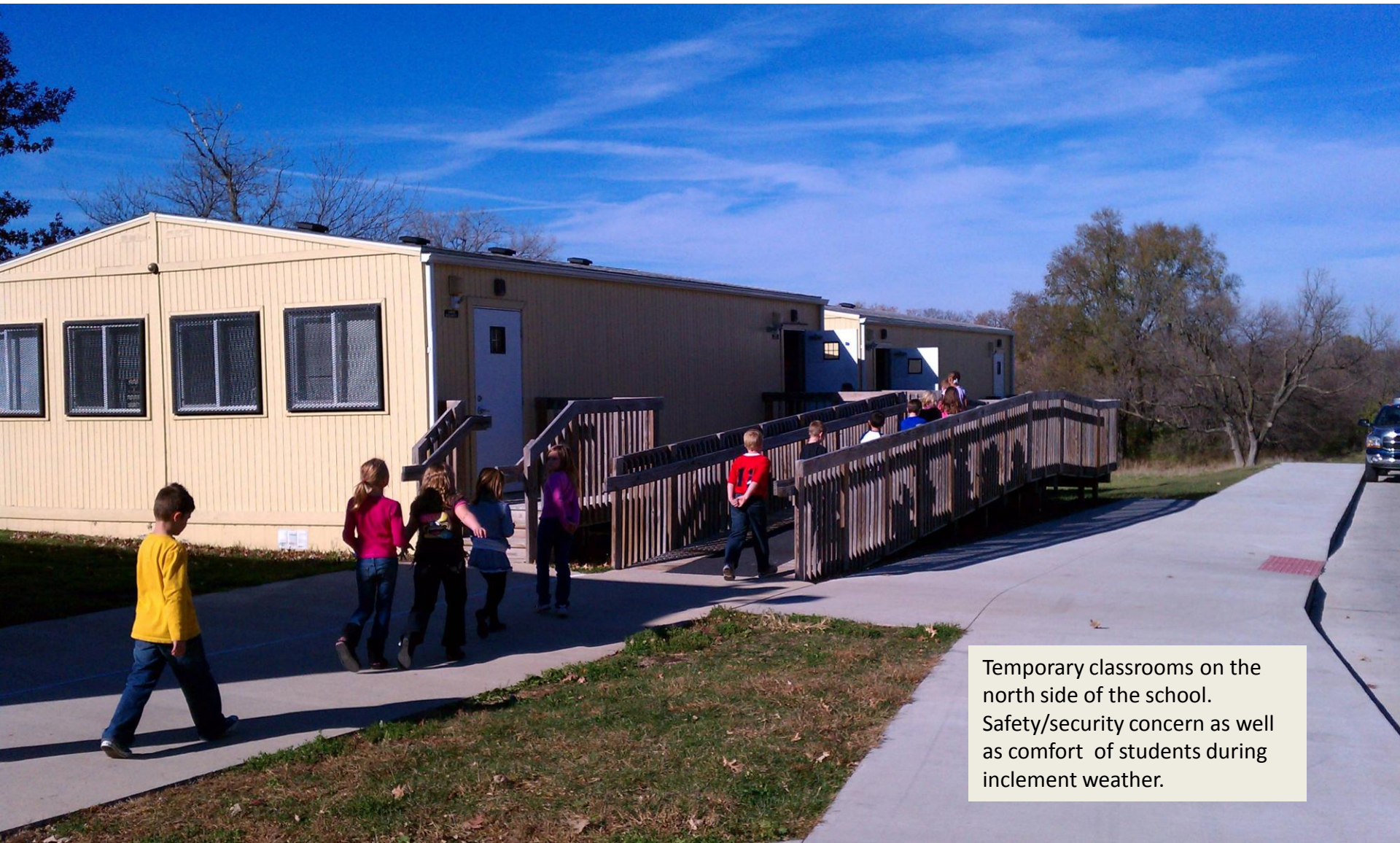
Temporary classrooms on the north side of the school. Safety/security concern as well as comfort of students during inclement weather.