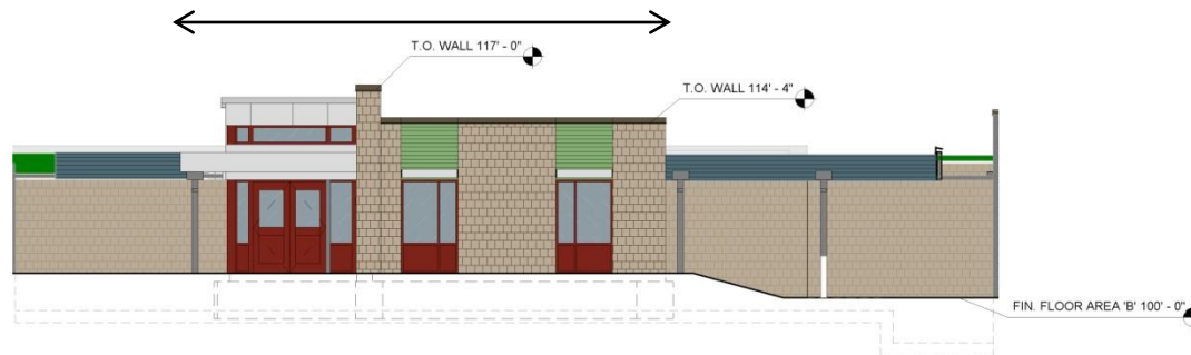
EAST ELEVATION ADMIN/FRONT ENTRY ADDITION