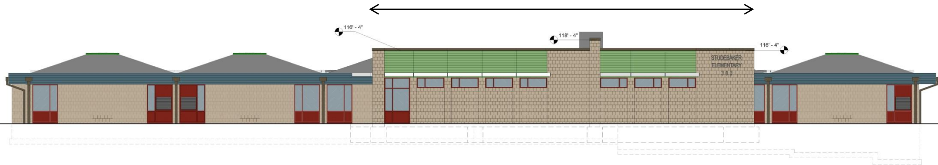
SOUTH ELEVATION CLASSROOM ADDITION