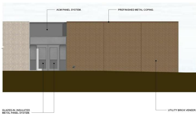
PRESENTATION EAST WING - EAST ELEVATION