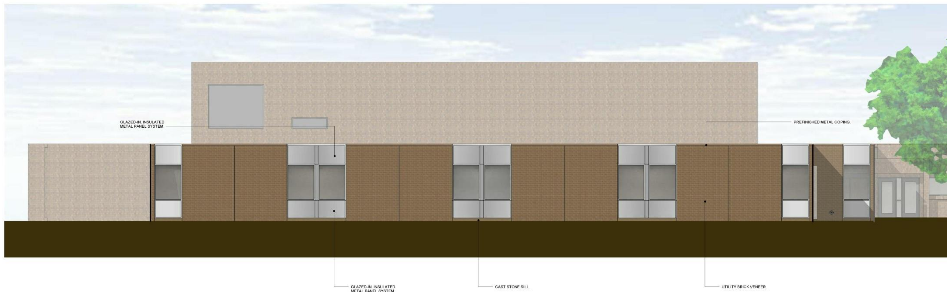
PRESENTATION EAST WING - NORTH ELEVATION