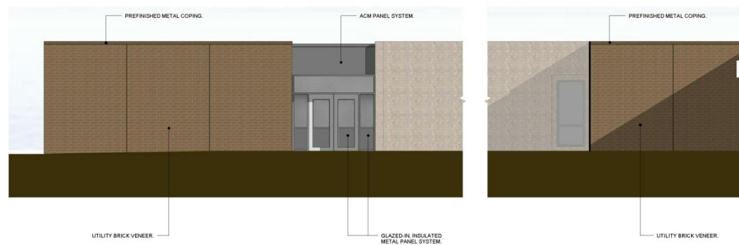
PRESENTATION EAST WING - WEST ELEVATION